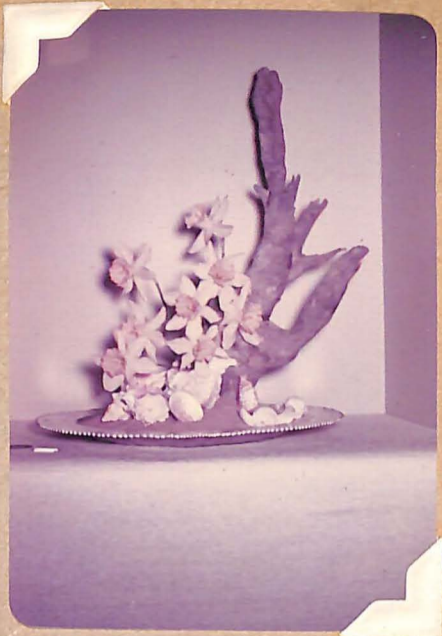
"By The Sea"