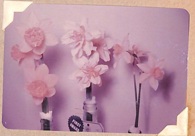
Blue Ribbon Winners Division III+IV