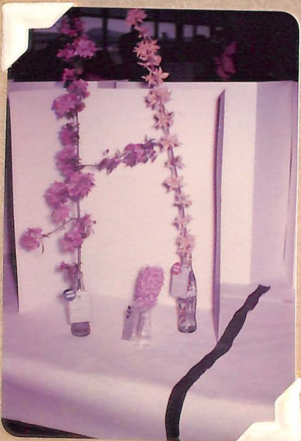
Flowering Shrubs Hyacinth