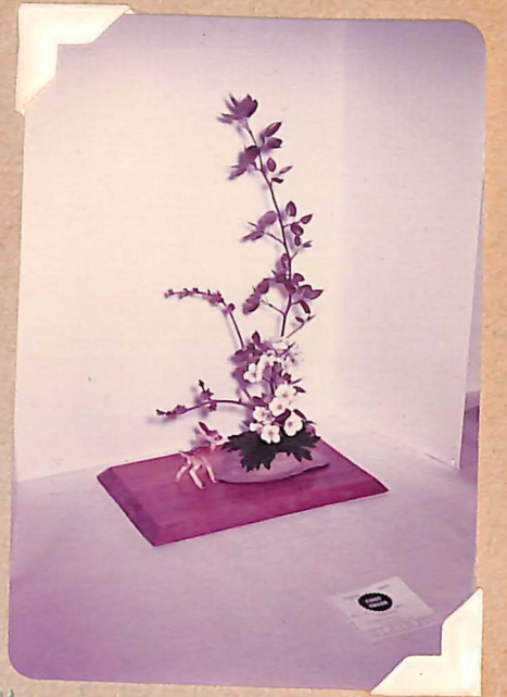
"Afternoon of a Faun"