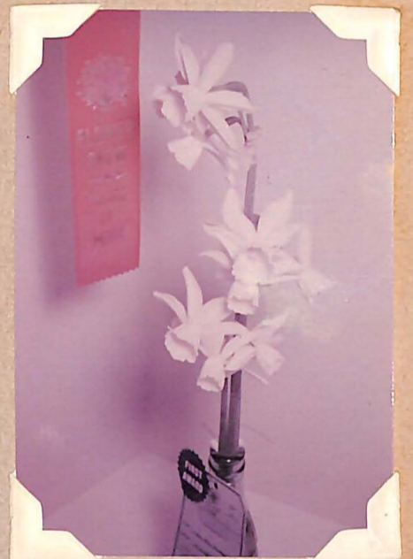
Award of Merit "Thalia"