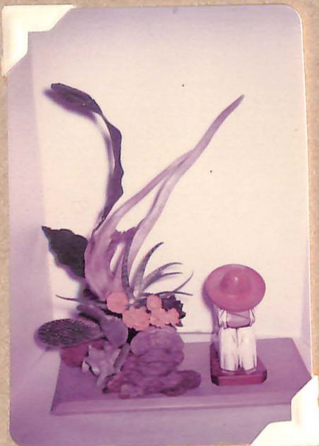
"Around the World"