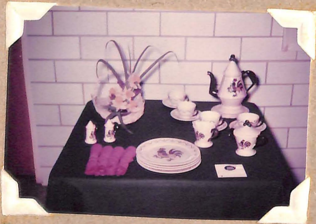
"Oh What a Beautiful Morning"