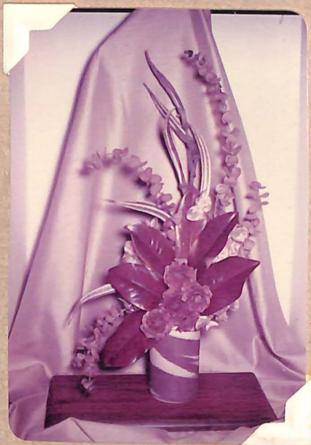
"I Could Have Danced All Night"