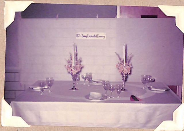
"Some Enchanted Evening"