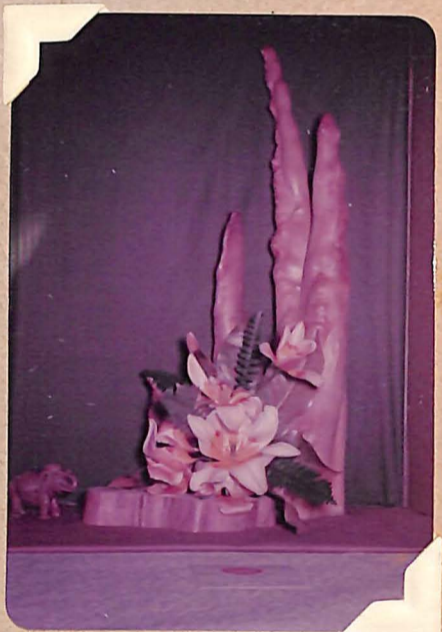
"A round the World"