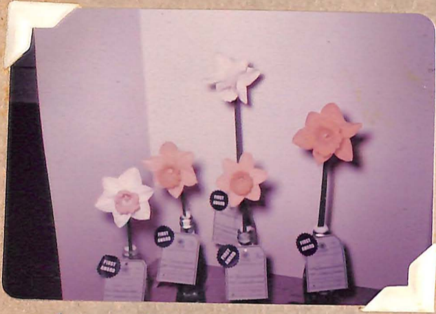
Blue Ribbon Winners Division I+II