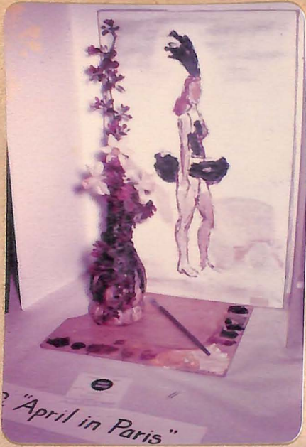
"April in Paris"