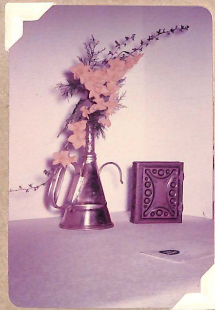
"Till the End of Time"