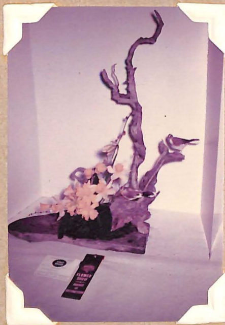
Award of Distinction "The Bird's Return"