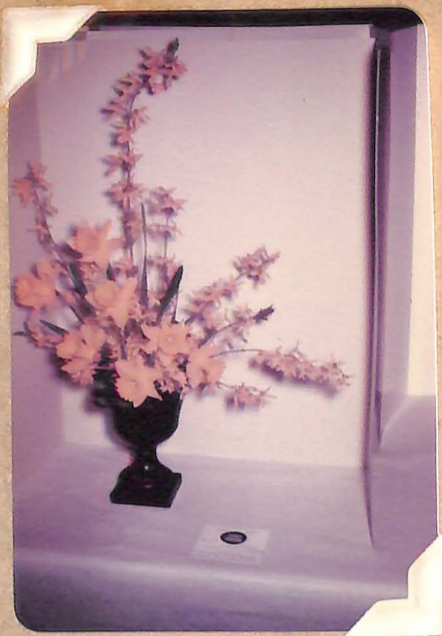
"Welcome Sweet Springtime"