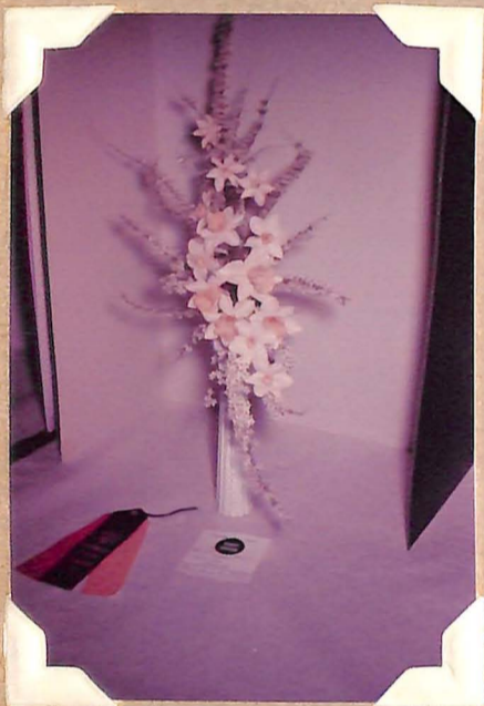
Tri-Color "The Rustling of Spring"