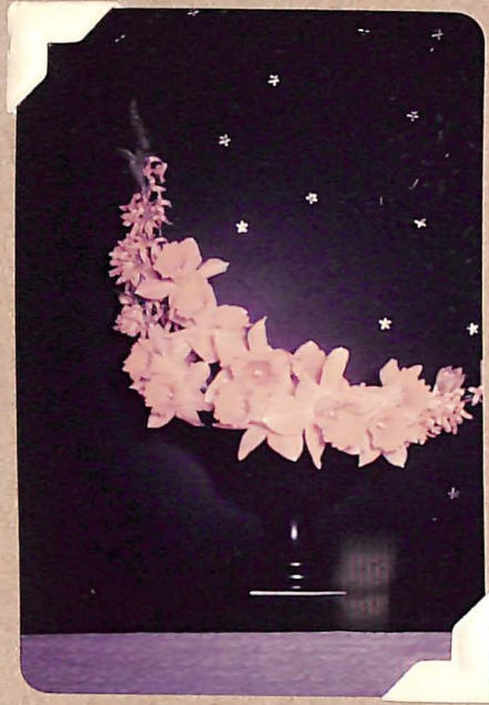
"Moonlight Becomes You"