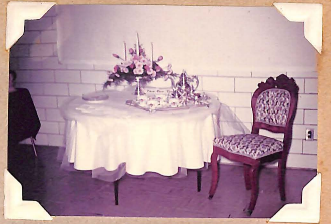
"Tea for Two"